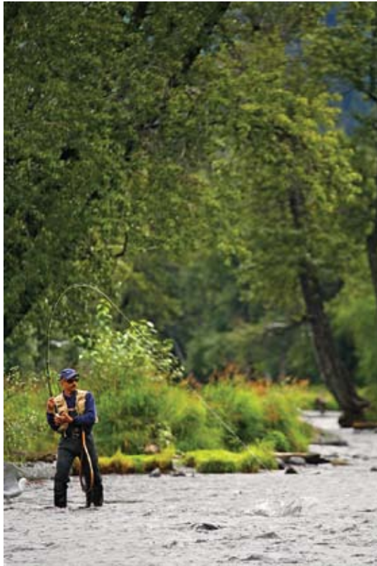
Chugach National Forest

People aren’t the only ones after fish. Bears, eagles and many other wildlife depend on the bounty of the river — and that makes for wonderful scenic rafting tours. Many companies offer both scenic floats and class III whitewater rides.