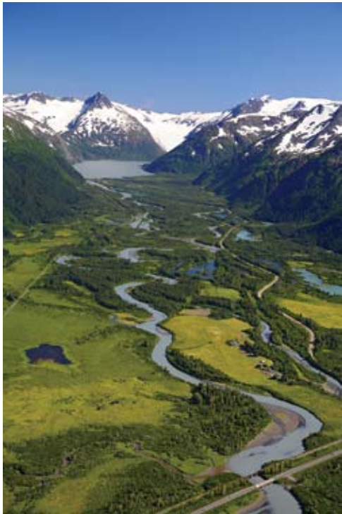
Chugach National Forest