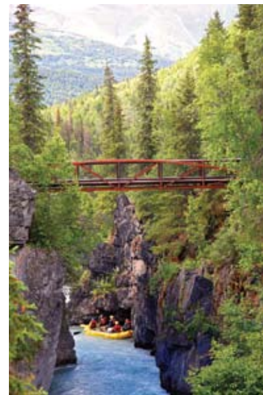
Chugach National Forest

INFORMATION SOURCES: Hope Chamber of Commerce: www.hopealaska.info