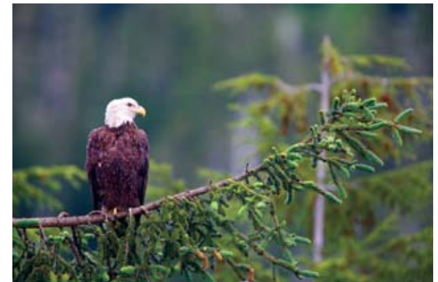
Chugach National Forest

SERVICES: Lodges, cabins, bed and breakfasts, campgrounds in the area, Post Office, limited services.