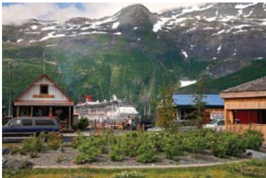
Chugach National Forest

INFORMATION SOURCES: Begich, Boggs Visitor Center: (907) 783-2326 or (907) 783-3242 www.fs.fed.us/r10/chugach/chugach_pages/bbvc.html Greater Whittier Chamber of Commerce: www.whittieralaskachamber.org