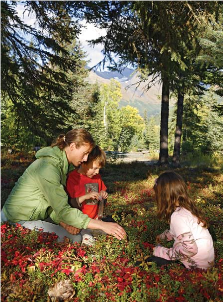
Chugach National Forest

MAJOR ATTRATIONS: Upper Trail Lake (fishing, flightseeing), Estes Brothers Grocery & Waterwheel (historic replica & artifacts, photo display and information center), numerous popular trailheads (hiking, biking, wildlife viewing, berry-picking; winter skiing, sledding, snowshoeing, and snowmobiling).