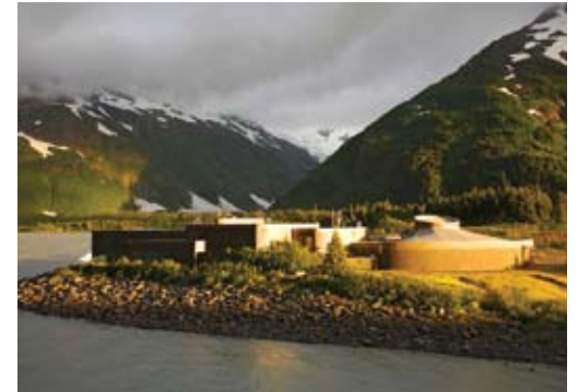
Chugach National Forest

A 5-mile drive up this road leads to Portage Lake, Begich, Boggs Visitor Center, and boat access to Portage Glacier. The visitor center was built upon the terminal moraine left behind by Portage Glacier not so long ago (1914). Inside you'll find award-winning exhibits, a film, and information services. Outside, you may see icebergs floating in the lake. The glacier itself has retreated out of view, but an hour-long boat tour can take you to it. Further up the valley, you can drive through the 2.5-mile long mountain (toll) tunnel to Whittier, the gateway to Prince William Sound.