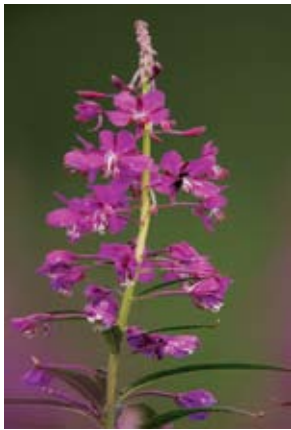
Chugach National Forest Fireweed

In August, the road comes alive with brilliant splashes of fireweed. No scenic Alaska photo would be complete without at least one of these tall, purplish pink stalks in the foreground. The region's not-so-friendly plants include cow parsnip (it contains a phototoxin that can cause blisters if you touch it) and devil's club (barbed stalks can be painful).