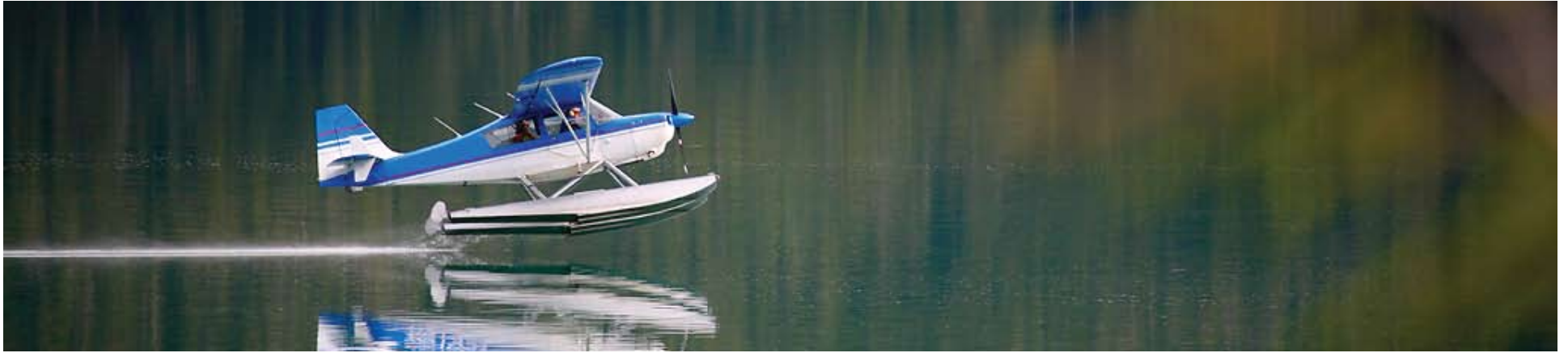
Chugach National Forest