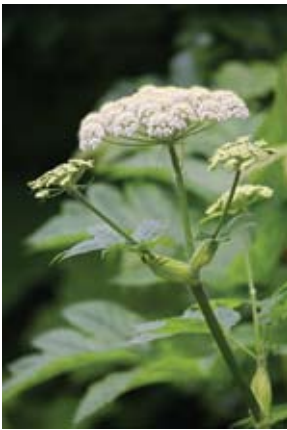
Chugach National Forest Cow Parsnip