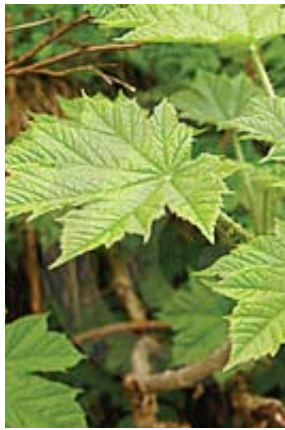
Chugach National Forest Devil's Club