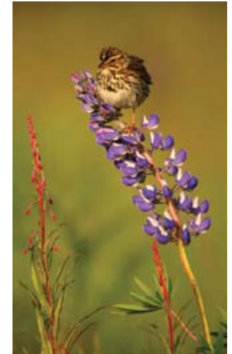
Chugach National Forest

A telephoto lets you get close shots and still keep a safe distance away from bears, moose and other wildlife.