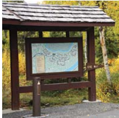
Chugach National Forest

These are great spots to bask in glacier views...and ponder the fact that if you were standing here 10,000 years ago, you wouldn't see anything — because you'd be under 3,000 feet of glacial ice. Interpretive signs share more about everything from gold rush history to hooligan fishing and more.