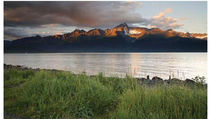
Chugach National Forest

Touted as Alaska’s “windows to the sea,” this popular visitor attraction is both a public aquarium and an ocean wildlife rescue, rehabilitation and research center. Exhibits immerse visitors in Alaskan marine ecosystems and provide opportunities to watch animals in naturalistic habitats.