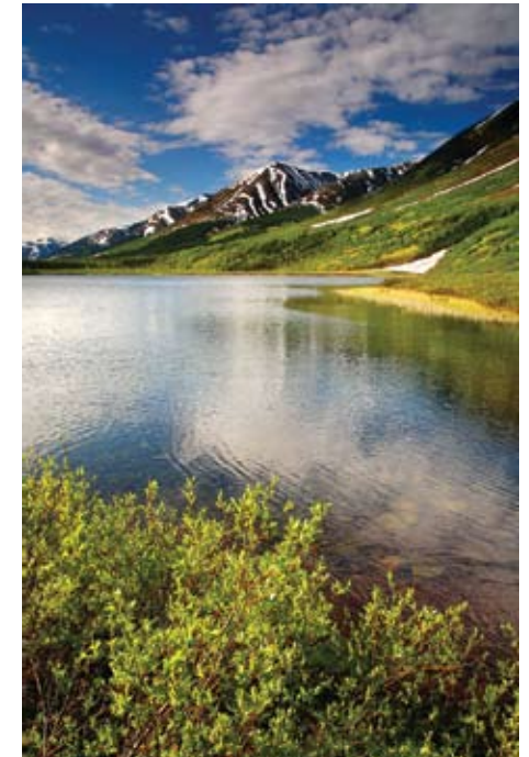
Chugach National Forest

This scenic little spot is a hideaway for rainbow trout and Dolly Varden. Throw in a line or just enjoy the view and the interpretive signs.